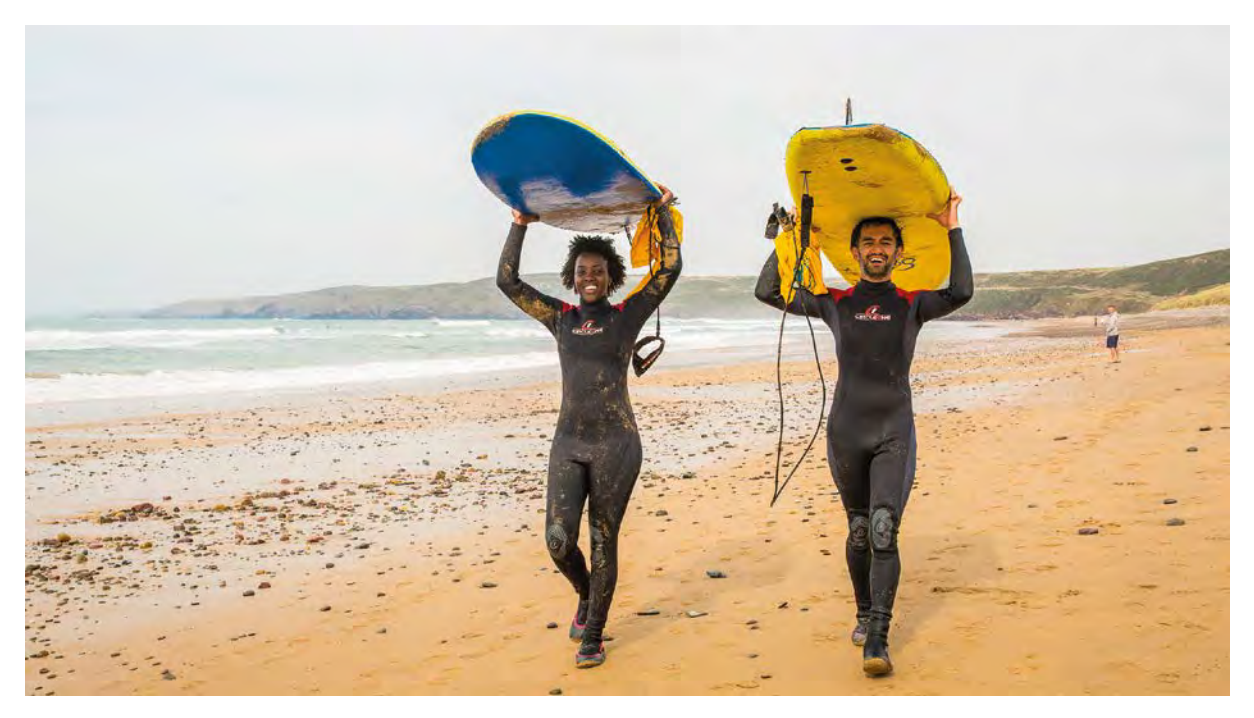
Surfing on the Pembrokeshire Coast.

Equality Objective 4: By 2024, we will have developed and delivered projects and schemes that have positive benefits for those facing inequalities, in particular children and young families from deprived areas.