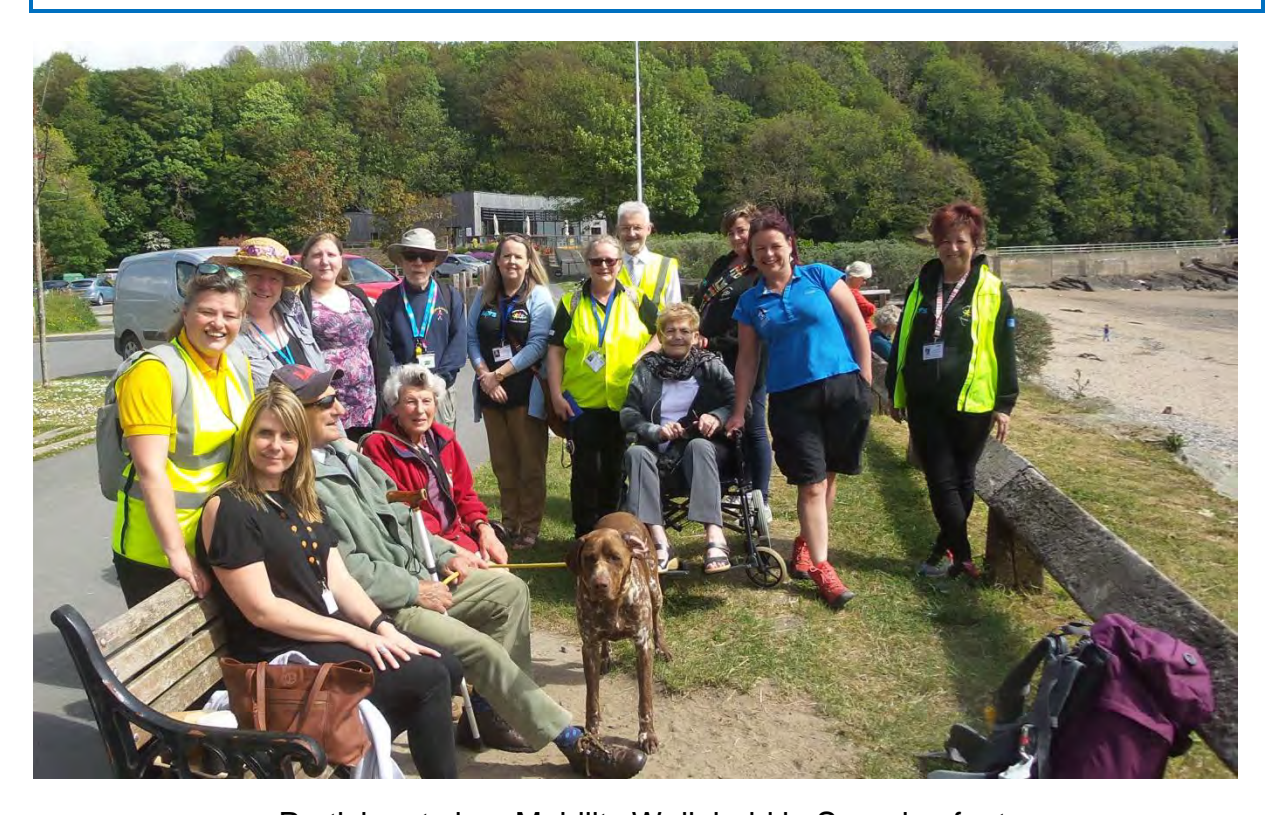
Participants in a Mobility Walk held in Saundersfoot.

Equality Objective 9: By 2024, have in place mechanisms to enable a wide range of groups and people to participate in an ongoing conversation about the National Park.