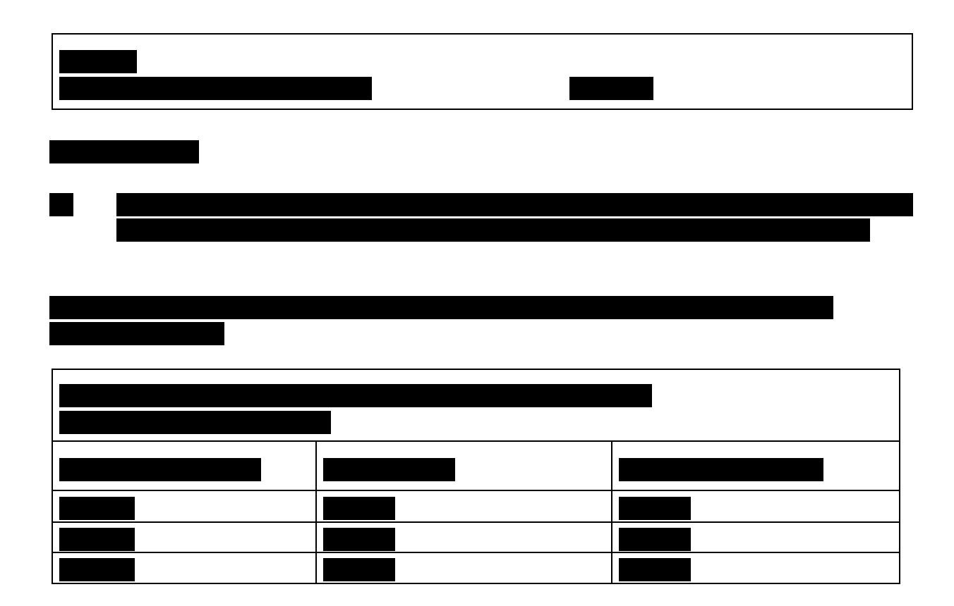
Table 4: Fees for co-opted members (with voting rights) of local authorities (including national park authorities and fire and rescue authorities)