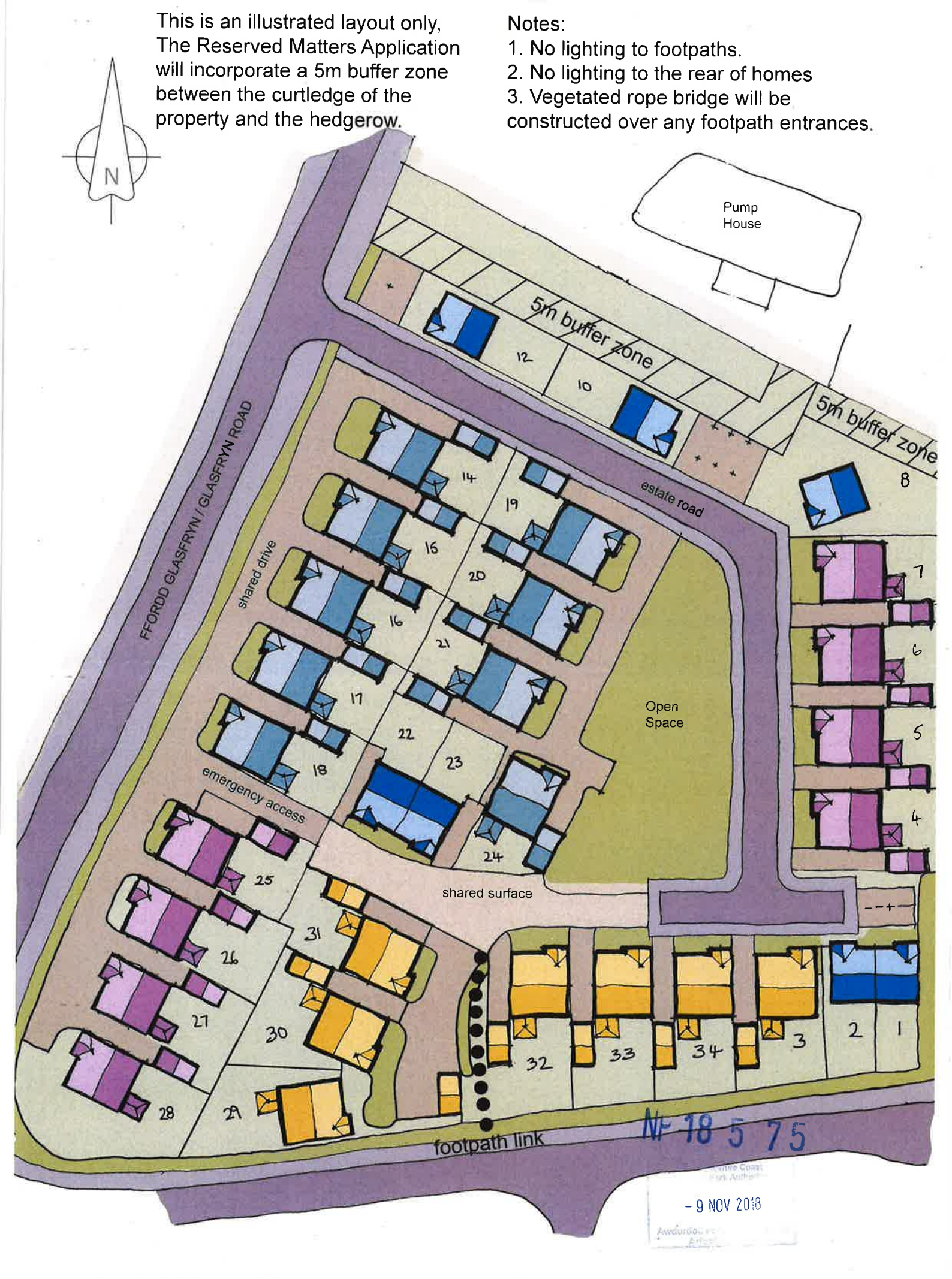
Land off Glastryn Road; St. Davids. Drg no: SK03'E' Date: 07/11/18 1:50p@A342