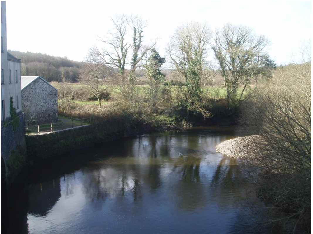
Figure 4 - view over Blackpool Meadow from Blackpool Bridge

• VP6. Views across the river from the north/north-west from the public path/former driveway. There are occasional views of the mill complex and the meadow through the belt of trees between path and river.