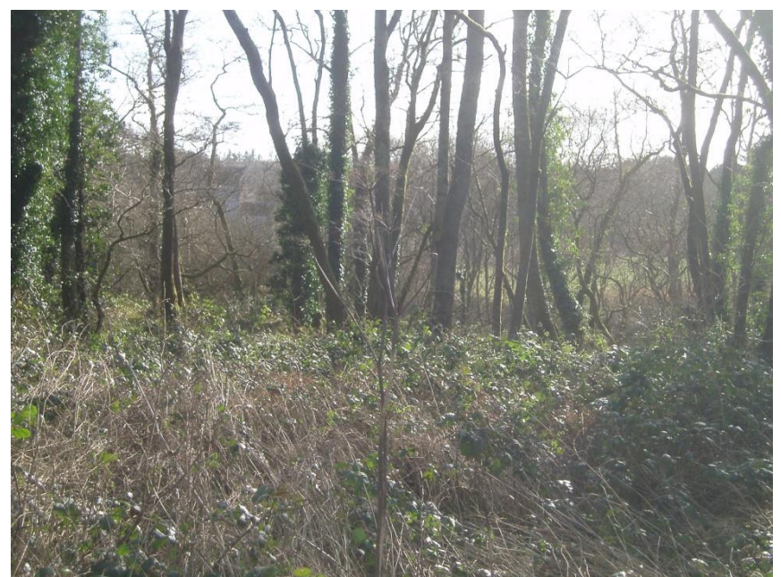
Figure 5 – view of Blackpool Mill and Meadow from north of Eastern Cleddau

From here, the impact of the proposed development will be high, with railway, station, platform and events building all prominent.