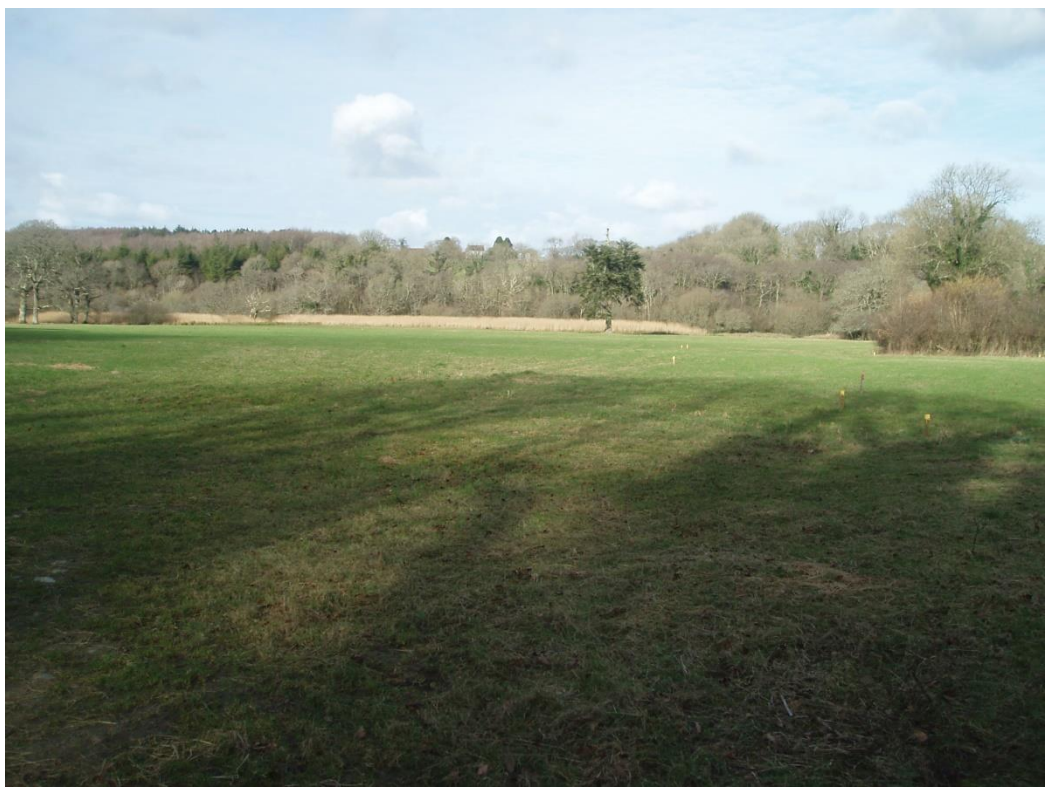
Figure 6 - High Toch Farmhouse - visible to centre of tree-line

• PROPOSED STEAM TRAIN AND INFRASTRUCTURE. It is noted that screen-planting is proposed for the eastern boundary of the meadow, which will serve to shield short-range views between the mill and steam railway. However the 'Blackpool Mill Platform' lies within the immediate setting of the mill complex and despite being a low-level structure, would be highly visible when in use (people, signage, bins etc). The adjacent track forms part of the circular route, with a 'siding' off to the engine house. This all introduces the railway operation within the immediate curtilage of the mill