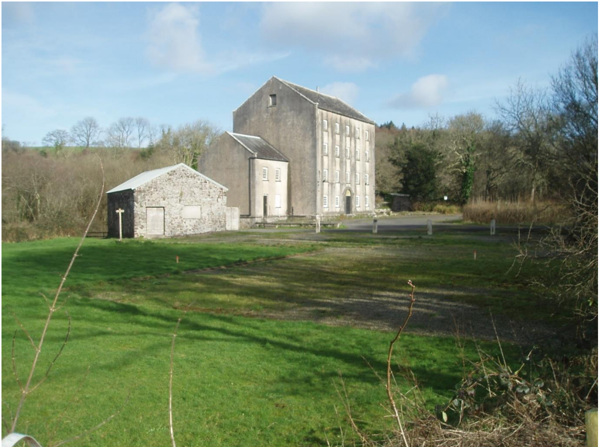
Figure 7 - Mill and former forge building