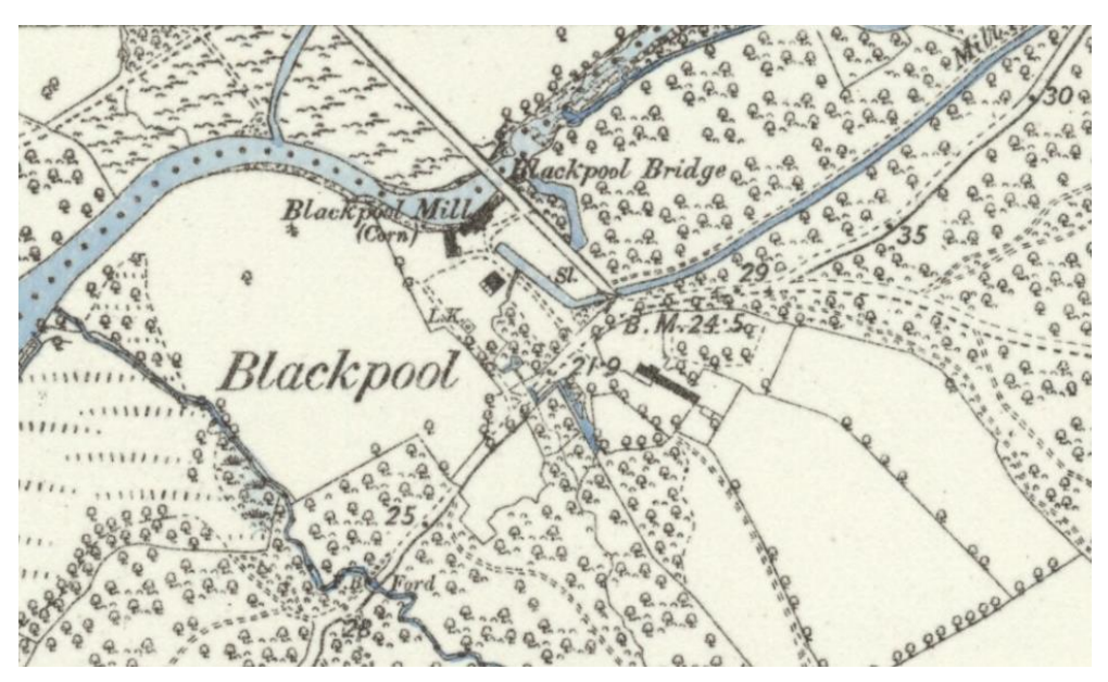
Figure 3 - extract from 1887 O.S. Map