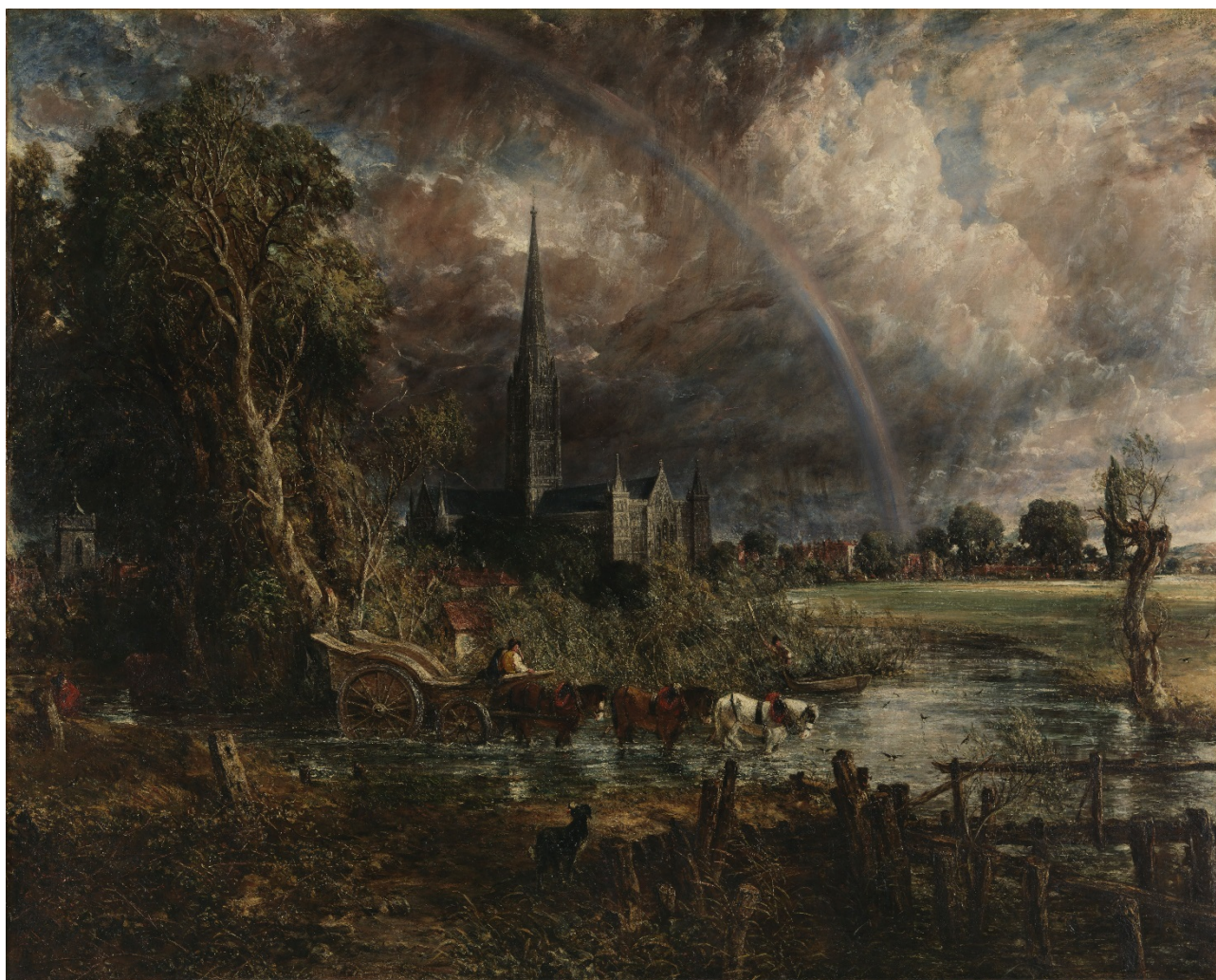
Salisbury Cathedral from the Meadows 1831, John Constable (1776-1837)

Purchased by Tate with assistance from the National Lottery through the Heritage Lottery Fund, The Manton Foundation, Art Fund (with a contribution from the Wolfson Foundation) and Tate Members in partnership with Amgueddfa Cymru-National Museum Wales, Colchester and Ipswich Museums Service, National Galleries of Scotland, and The Salisbury Museum 2013