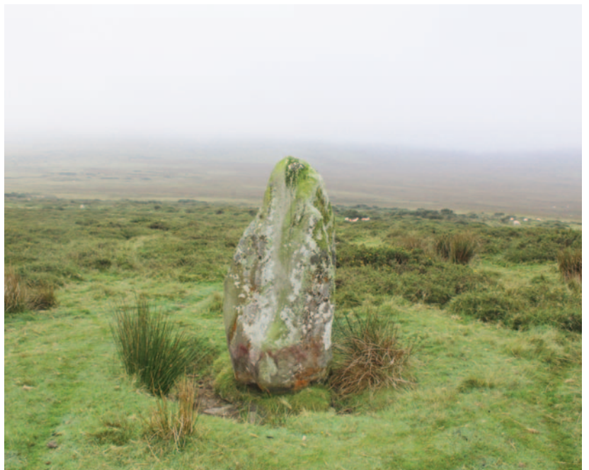
Standing stone at the westernmost portion of the site near the track.