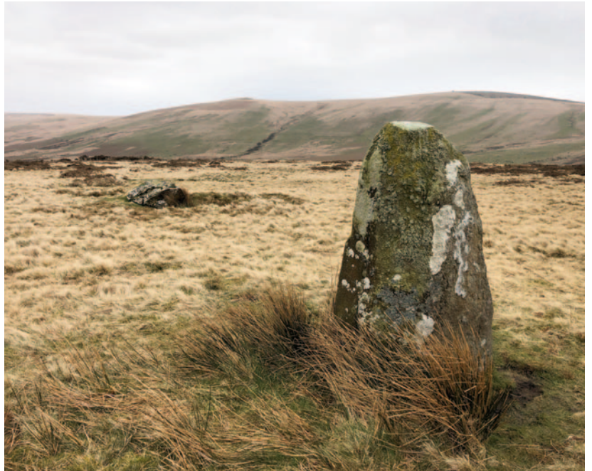
Standing stone at the eastern portion of Waun Mawn with one of the former standing stones laying flat in the background.

Caution: Parking is limited to two laybys shown on the map; please do not park in gateways or passing places. The land is designated a Special Area of Conservation, a Site of Special Scientific Interest and a Scheduled Monument and protected by law. Unauthorised disturbance or damage is a criminal offence. Please respect this protected landscape, its archaeology and natural habitat. Please keep dogs on leads as sheep graze here.