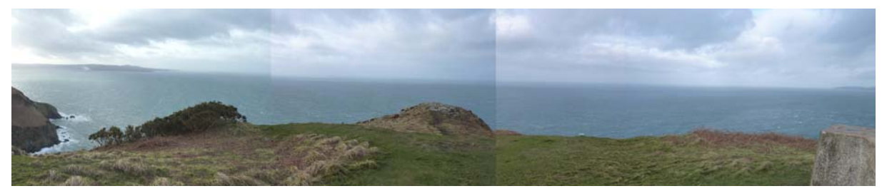
Area visible from Dinas Head