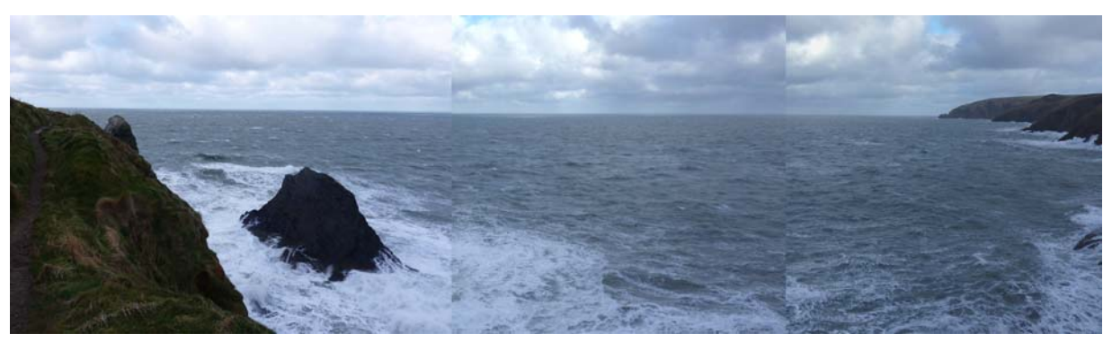
Area visible from Ceibwr Bav