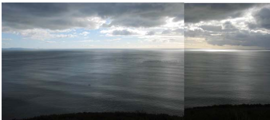
Area over horizon from Pendine Sands in Carmarthen Bay- Rhossili Downs lies to east and Caldey Island to west