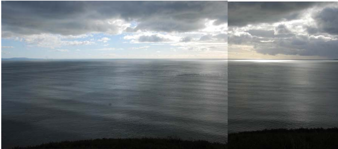
Area visible from Pendine Sands in Carmarthen Bay- Rhossili Downs in Gower lies to east and Caldey Island to west [right]

Summary Description The area is located in the outer reaches of Carmarthen Bay south east of Caldey Island and west of the Gower. It is predominantly shallow water less than 30m deep with a sand seabed and low waves.