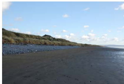
View east along Pembrey Sands