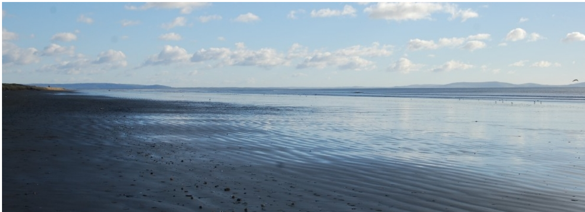
View south east across Carmarthen Bay towards the Gower