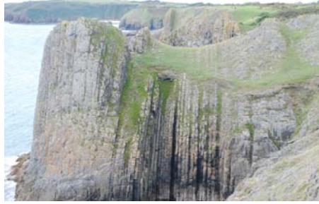
Whitesheet Rock from Lydstep Point looking west