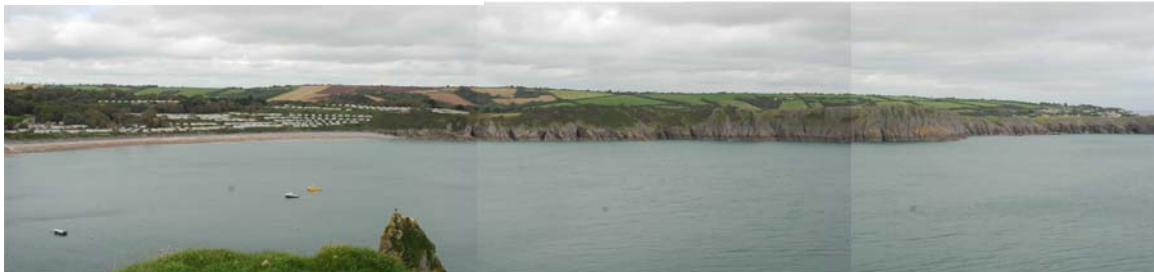
Lydstep Bay from Lydstep Point