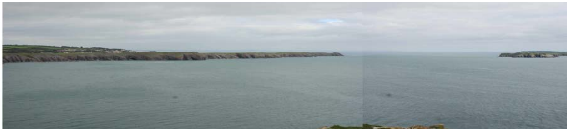
Looking east from Lydstep Point to Caldey Sound