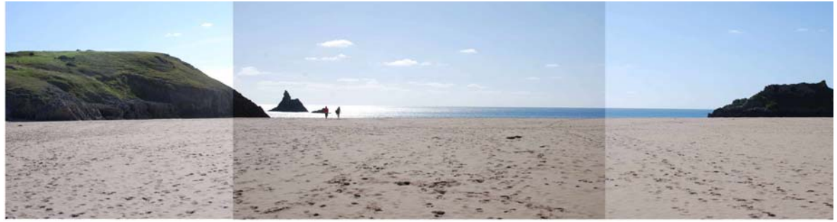
Broad Haven beach looking towards Church Rock