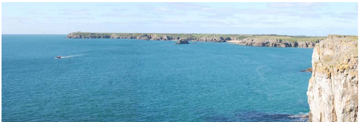
View to St Govan's Head from Stackpole Head