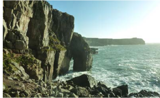
Rocks and arches under limestone cliffs