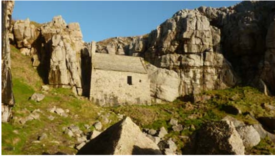
St Govan's Chapel with channelled views out to sea