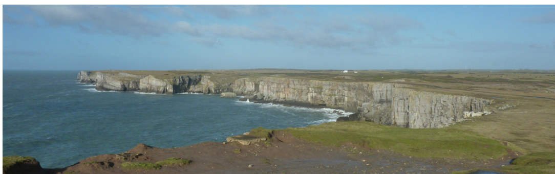
Looking west from St Govan's Head