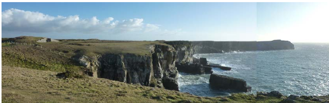
St Govan's Head from the west