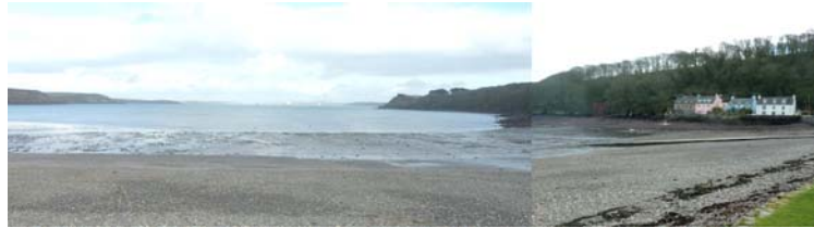
Dale Roads with refinery in distance