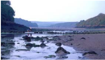
Sandyhaven Pill