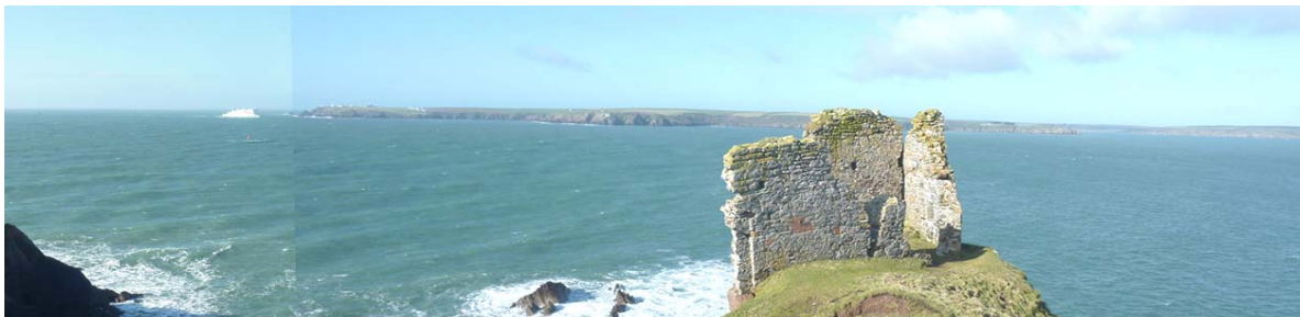
Mouth of Milford Sound from near Rat Island, with ferry off St Ann's Head