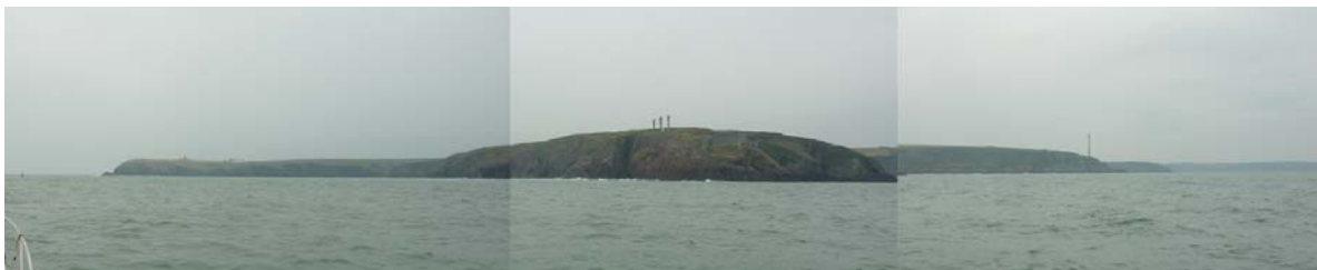
In the mouth of the Sound approx 500m from shore