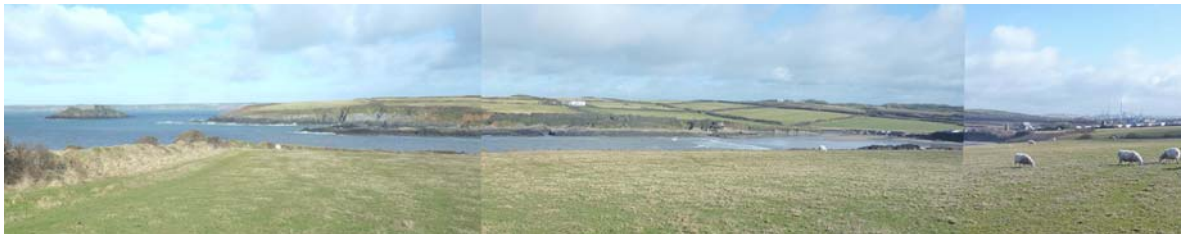
Panorama looking north over Angle Bay, refinery visible on right