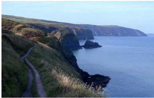
Looking towards Newport Bay