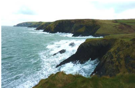
Looking north east from Careg Wylan