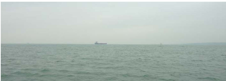
View of area at Sea north east of Skomer