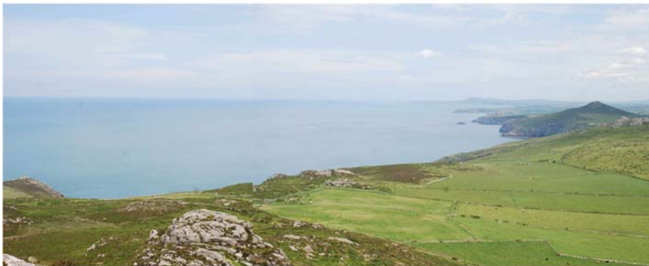
View of northern component of area from Carn Llidi with SCA 13 in middle ground