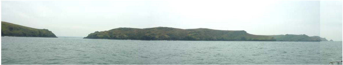
Looking to Skomer from the sea, approximately 500m to the north