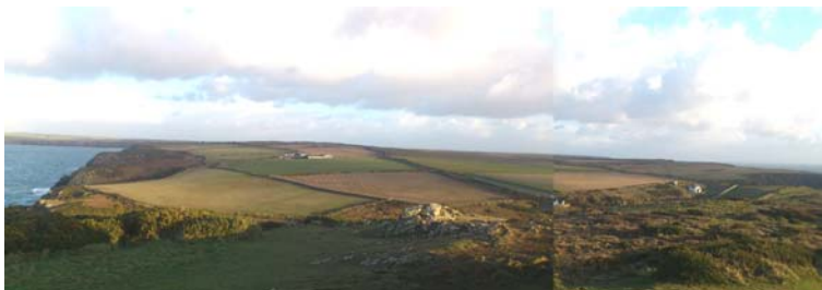
Marloes peninsula looking east