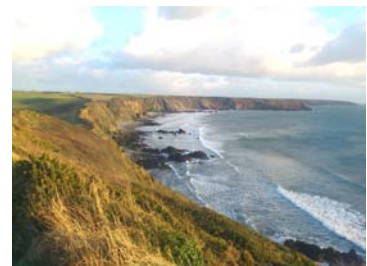
Marloes Sands looking south east