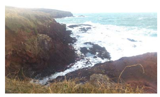
West towards Huntsman's Leap