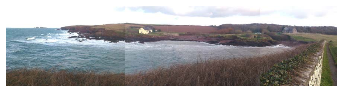
St Brides Haven, Stack Rocks offshore in distance

Reproduced from Ordnance Survey digital map data © Crown copyright 2013. SCA 23: St Brides Bay south coastal waters - The Nab Head Sources Ordnance Survey, Seazone, Pembroketrie Coast National Park Authority, CCW. Cadv.