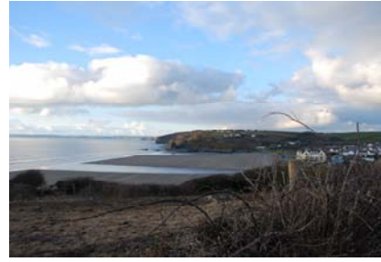
View across Broad Haven beach