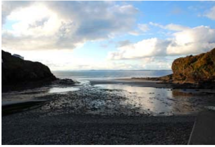
View from Little Haven across St Bride's Bay