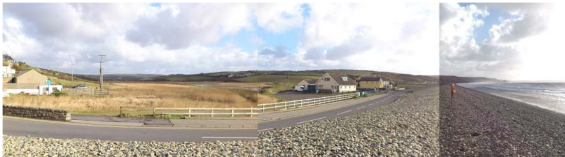
Looking south from Nawnale