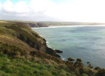
East from near Dinas Fach