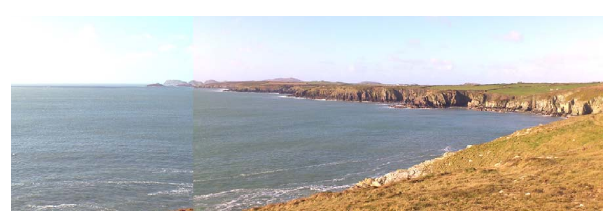
Looking west from near Caerfai to Ramsey Island in distance