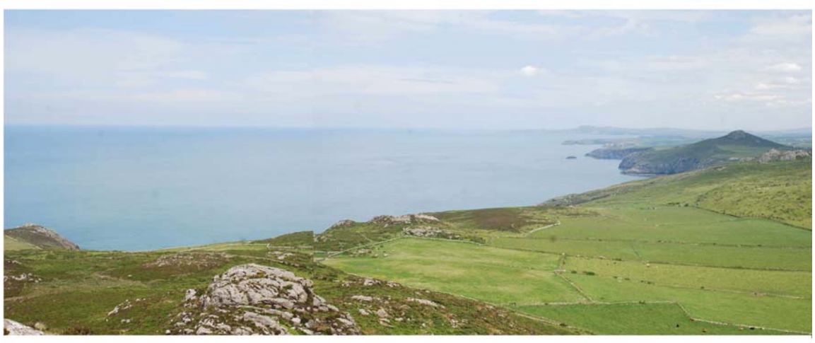
View of northern component of area from Carn Llidi in SCA14 with SCA13 and SCA28 in middle ground