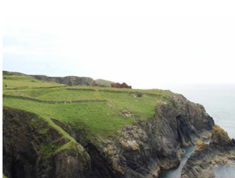
Porth Ffynnon- west of Porthgain- with quarry building