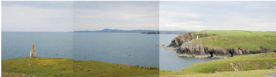
Porthgain harbour markers looking north east towards Strumble Head