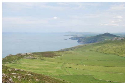
Carn Penberry from Carn Llidi looking north east