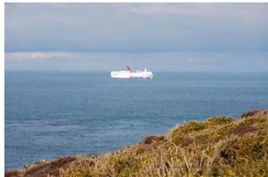
Sea with ferry leaving area for waters closer to Fishguard [taken from SCA 10]