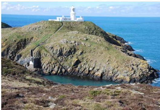
Sea beyond the Strumble Head lighthouse [taken from SCA 11]