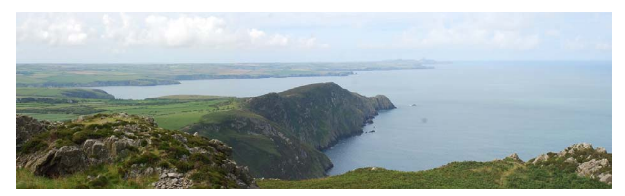
Penbwchdy from Garn Fawr