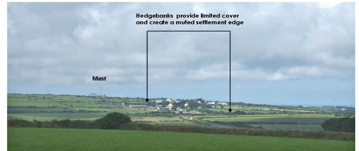
Eastern edge of Square & Compass