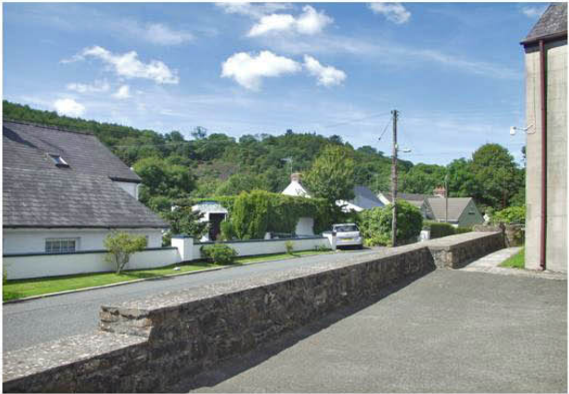
Pleasant Valley - view west from the church towards the National Park