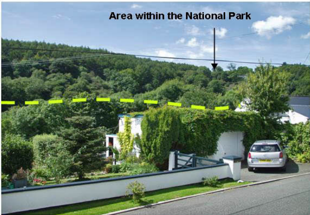
View to the south west

There is very limited scope for in-fill residential development within the village, as a result of the steep landform and the continuous woodland cover to the south west. Much of the settlement lies outside the National Park, the boundary of which runs along the lower edge of the western valley-side woodland