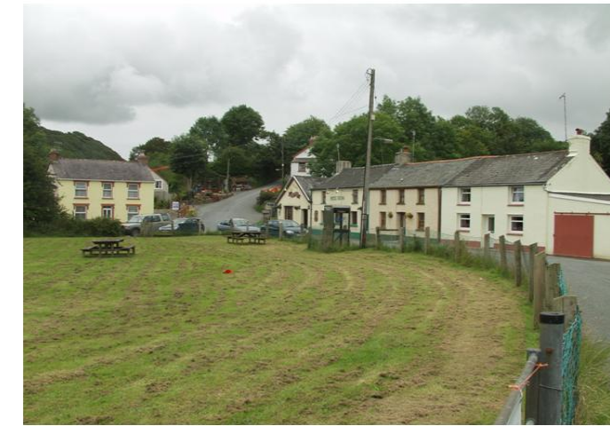
Llanrychaer viewed from the south west edge of the village green