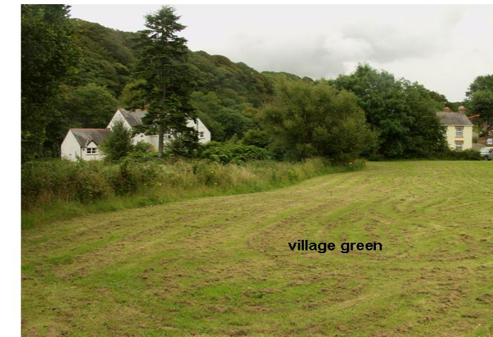
Northern edge of the village green

Strong sense of place created by the valley setting, steep valley sides with dense woodland cover and mature hedgebanks. The village green provides a focal point but would benefit from greater visual enclosure to the north