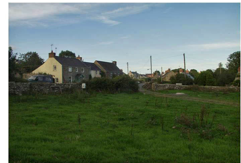
This view illustrates the typical vegetation cover and sense of enclosure within the village

Lawrenny lies within the Milford Haven Waterway area, included on the Register of Landscapes of Outstanding Historic Interest in Wales