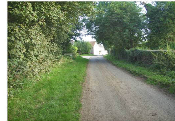
Northern edge of the village

Well-vegetated northern fringes and clearly defined settlement edge