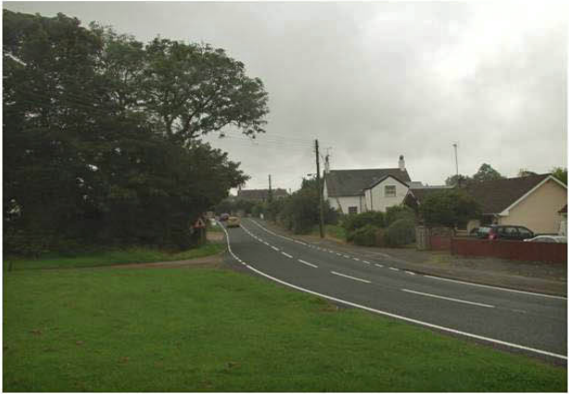
Centre of the village

The National Park boundary runs along the road verge on the left hand side in this view.