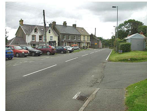
South western part of the village - Bwlchmawr

A less constricted section of linear development, with a small green to one side. The adjacent high ground to the east is a strong locally distinctive feature