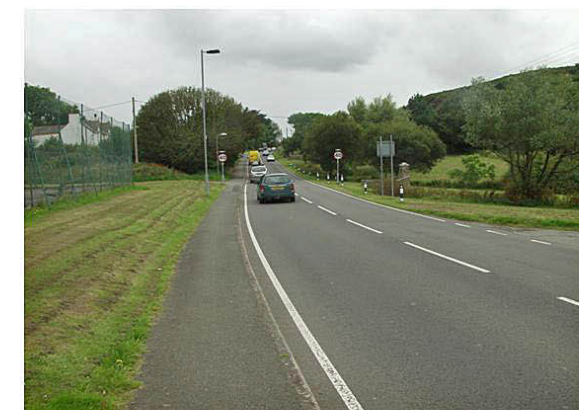
Northern section - at the Dinas Cross/ Bryn-henllan junction

The open area of land which separates the two main sections of Dinas Cross must be kept free from development if the two sections of the village are not to coalesce to form a single linear settlement strung out along the main A487 road