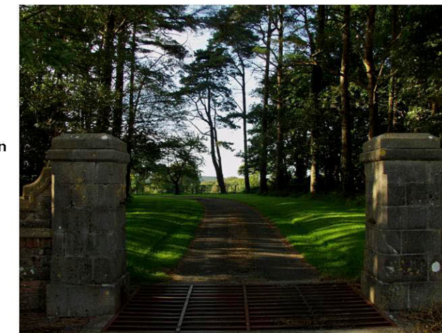
Entrance to Cosheston Hall parkland

The northern boundary of Cosheston, which abuts the National Park, is well-defined and strongly vegetated with mature hedgebanks, trees and woodland