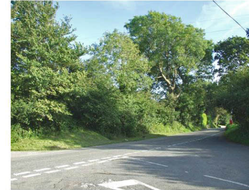
Northern edge of the village

The northern boundary of Cosheston, which abuts the National Park, is well-defined and strongly vegetated with mature hedgebanks, trees and woodland