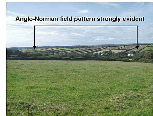
Angle from the south