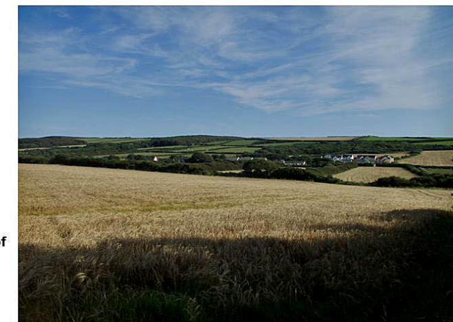
Angle from the north west

The recent housing cluster at the south-western extremity of the village is discordant with the dominant linear pattern of the village built form along the bottom of the shallow valley