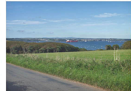
Woodland edge to Angle Bay

The concave landform, the linear settlement pattern and vegetation cover - mature woodland and hedgebanks - are locally distinctive landscape features