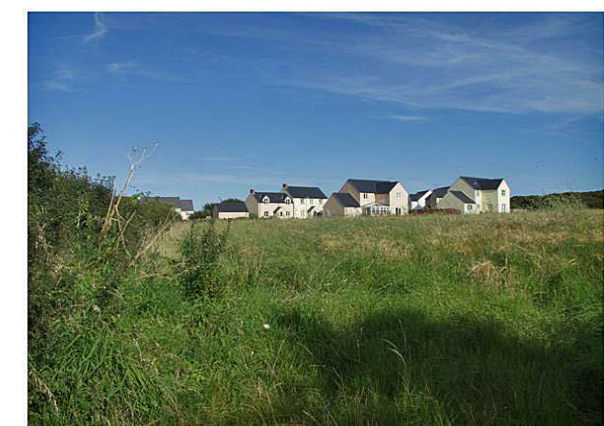
South-western edge of Angle

This recent housing cluster projects outwards in a line perpendicular to the line of the main street and is poorly assimilated into the local landscape by vegetation