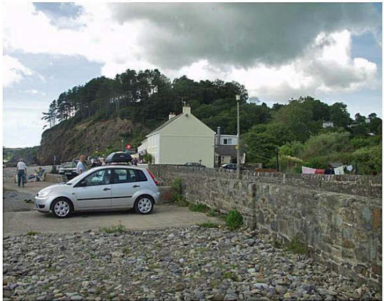
Western edge of Amroth

Steep valley sides and densely wooded backdrop are distinctive features in the village. The continuity of the wooded skyline should not be breached by any proposed residential in-fill development