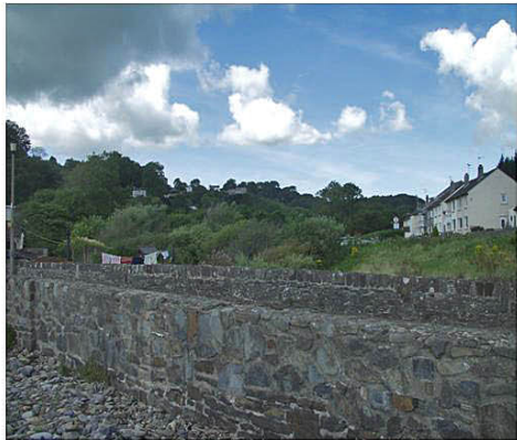
Centre of Amroth