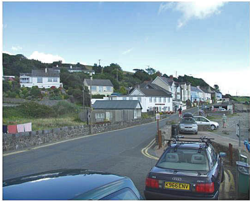
Eastern edge of Amroth