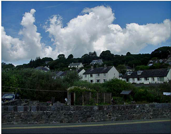
Centre of Amroth

Steep valley sides and densely wooded backdrop are distinctive features in the village. The continuity of the wooded skyline should not be breached by any proposed residential in-fill development